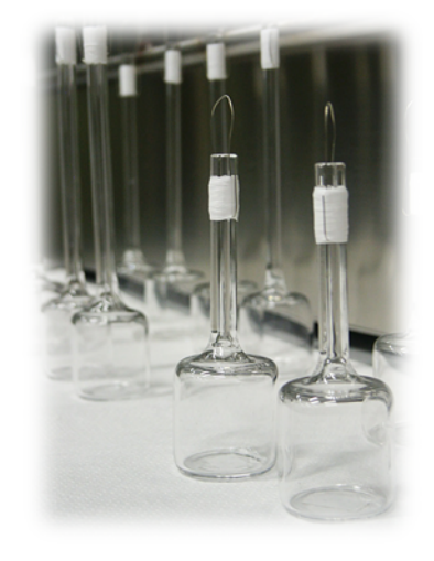
Fig. 1. Picture of diffusion vials realized.

The diffusion vials were realized in borosilicate glass, as shown in Fig.1, welding an open tube to a tank of 2 cm o.d. in which the liquid VOC was inserted. The diffusion tubes with i.d. in the range 0.6 - 2.2 mm and length in the range 5 - 10 cm were employed to provide nominal DR in the range 0.2 - 40 ug/min, at 26^{\circ} C.