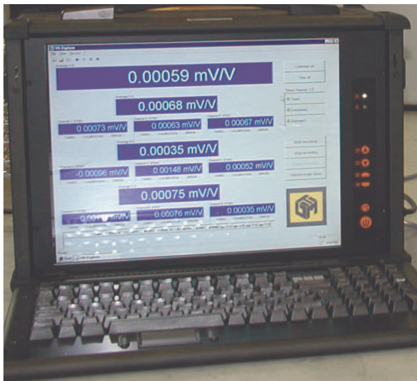
Fig. 2. VN-DIGITIZER 3.0

The VN-Digitizer 3.0 user surface is especially designed for the usage of the build-up-system. All nine channels are indicated together with the calculated average of the three groups as well as the average of all nine transducers.