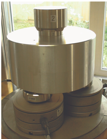
Fig. 3. COMPLETED BUILD-UP SYSTEM 1800kN