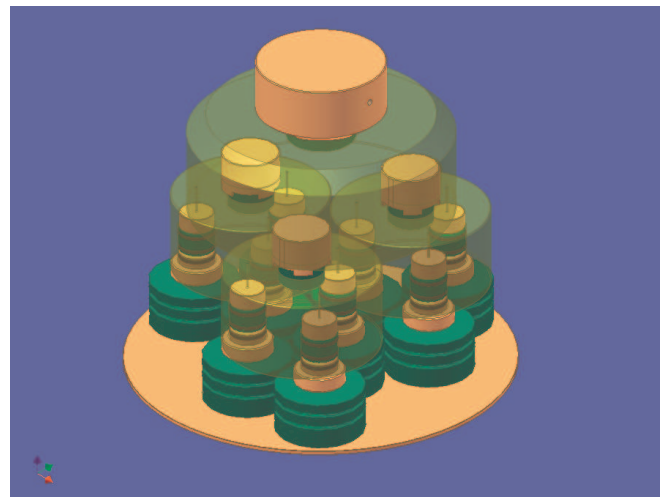
Fig. 5. BUILD-UP SYSTEM 5400kN (PRINCIPLE)