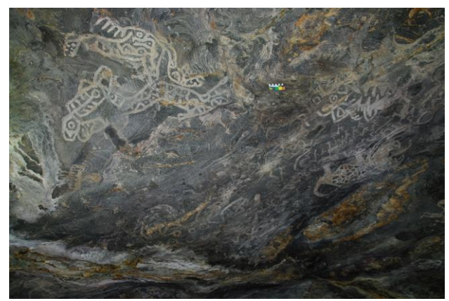
Figure 1: rock painting of a fantastic figure with snake and feline attributes in La Candelaria cave.

2). Also several overlapping cases have been observed between different bodies of the motif. In sum, all the macroscopic observations led us to formulate the hypothesis of this figure as an assemblage resulting of different painting episodes throughout a longer period of time and many artists. To this end, each body of different tonality was sampled for cross-sections and also analysed using portable XRF.