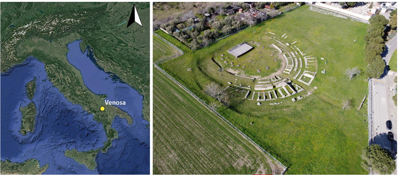
Fig. 1. Venosa: the archaeological site A -