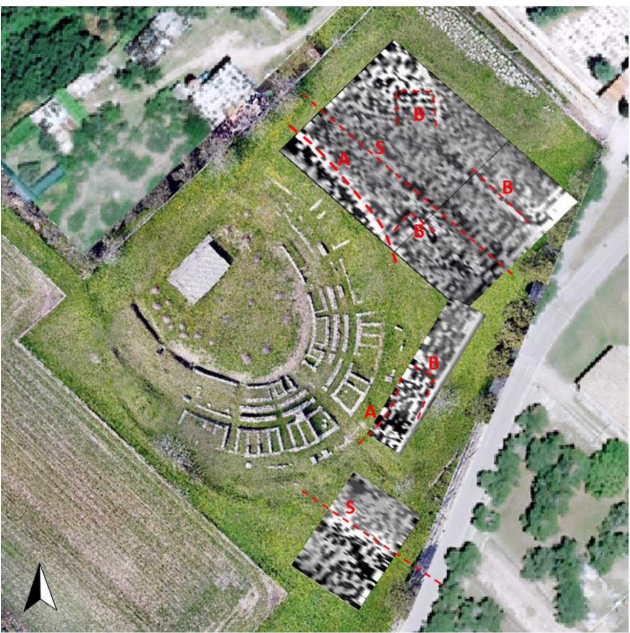
Fig. 4. Gradiometric map: A: amphitheater; B: walls; S: roads.