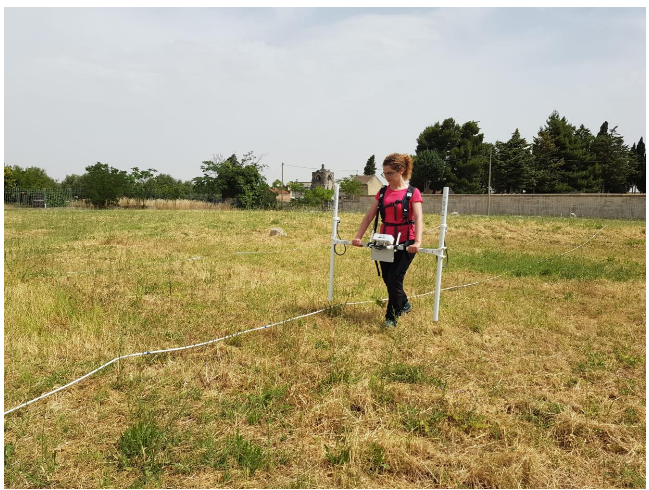
Fig. 2. Photo relating to the measurement phases with a magnetometer.