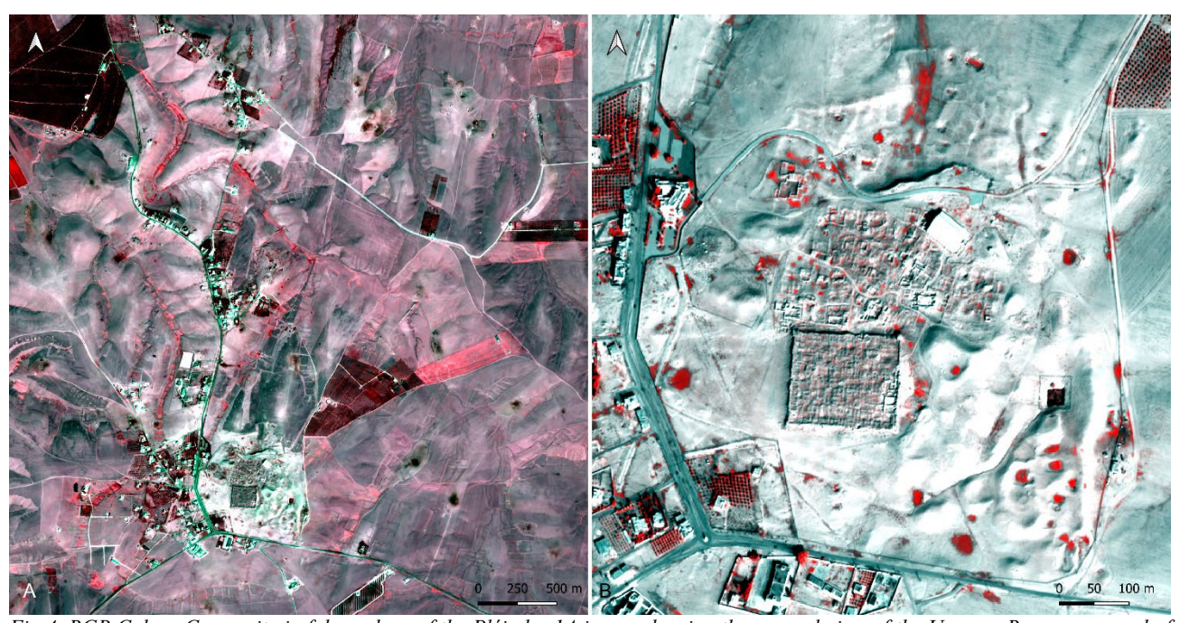
Fig 4. RGB Colour Composite in false colour of the Pléiades 1A image showing the general view of the Umm ar-Rasas area, and of the Pléiades Neo-04 image showing a detailed area of the late antique castrum and the Umayyad village.