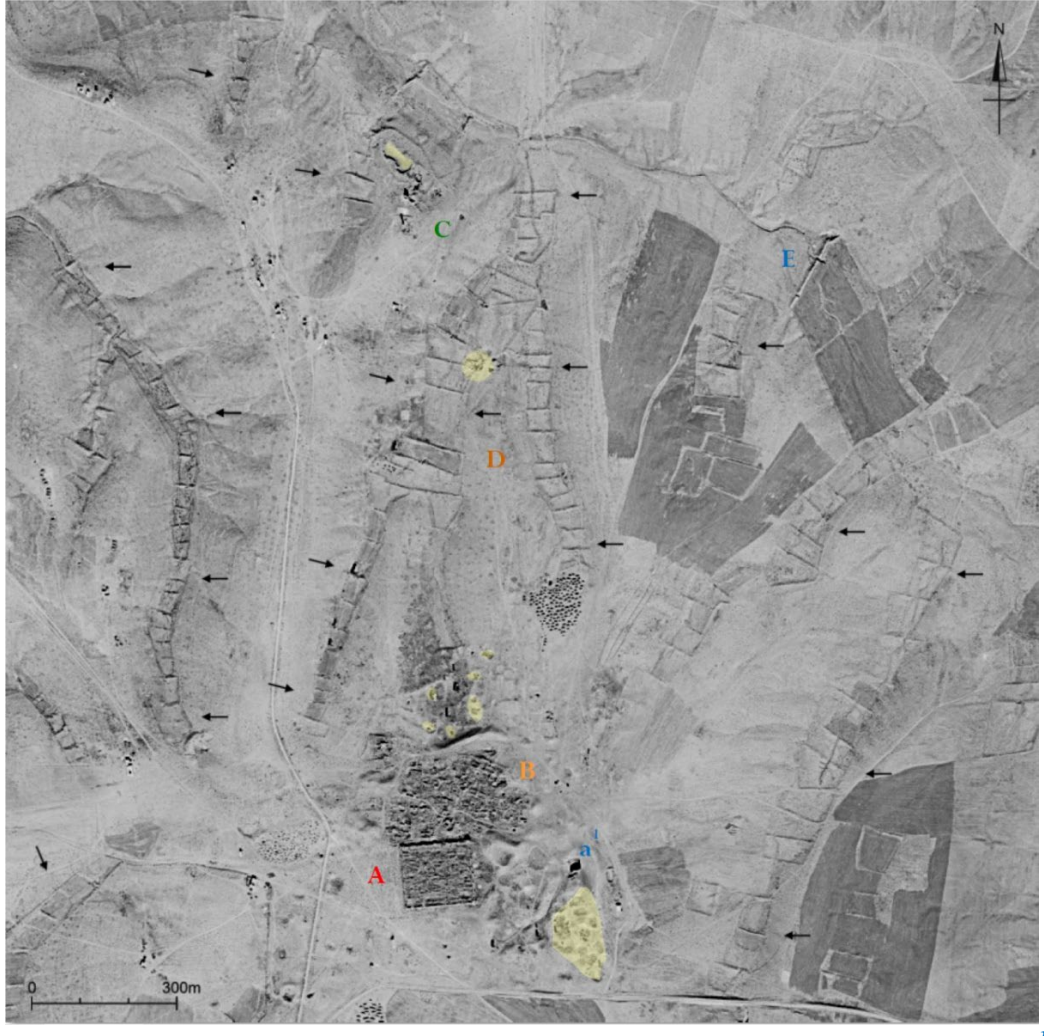
Fig. 2. Historical images. Hexagon KH-9 space photo taken in 1974/12/01. Roman castrum (A), hydraulic reservoir ( a^{I} ), Byzantine and Umayyade settlement (B), Stylite tower complex (C), system of irrigated plots (channels and dams) (D), hydraulic channels (indicated by arrows), dam (E), quarries (highlighted in yellow).

[7] F. Di Palma, R. Gabrielli, P. Merola, I. Miccoli, G. Scardozzi, "Study and enhancement of the heritage value of a fortified settlement along the Limes Arabicus. Umm ar-Rasas (Amman, Jordan) between remote sensing and photogrammetry", CAA Amsterdam 3-6 April 2023 (forthcoming).