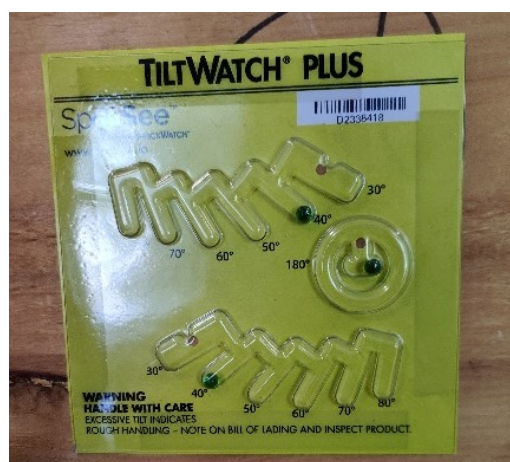
Figure 6: Tilt indicator of the package after delivery.

Additionally, Figure 6 depicts a tilt indicator that shows that the pallet at least once during the transportation from PTB to INRiM, was, at some point, tilted at least 40° or subjected to significant acceleration from both sides due to impact. Despite this, the system was fully functional when arriving at INRiM, requiring only a small amount of optimization of the mode matching of the light to the cavities.