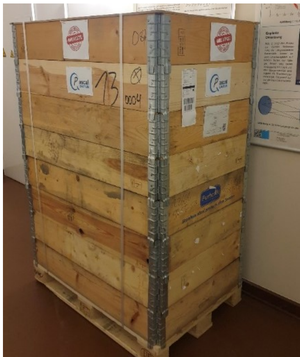
Figure 5: The package containing the TOP just after arrival at PTB, Berlin.

As was alluded to above, the relatively small size of the system enables the use of a standard EUR-pallet. As was shown in Figure 2, the pallet fits both the TOP and auxiliary equipment such as vacuum pumps, oscilloscopes, and spare parts, netting a total weight of around 300 kg. Packing the system in its entirety on a standard pallet makes it easy to ship by standard shipping services. At the time of the finalization of the manuscript the system has so far been successfully transported from RISE in Borås, Sweden, to PTB in Berlin, Germany, after which it was sent to INRiM in Turin, Italy, before it was routed to LNE in Paris, France by using commercially available service (at a cost of roughly 200 Euro per transport). Presently, only the final shipment back to RISE in Borås, and the final measurements, remain to be carried out.