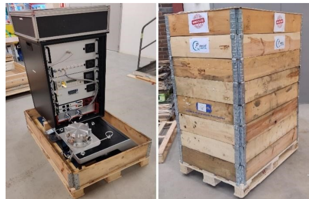
Figure 2: The TOP under packing.

Given this decision, the system was designed and constructed with this in mind. This has several advantages as it allows for significant relaxed constraints in terms of installation complexity, setup, and control and data management complexity. This is, for example, manifested in the possibility to ship many of the components in modules, such as vacuum pumps, electronics, and vacuum connections, which makes it possible to fit the full system on a standard EUR-pallet. See Figure 2.