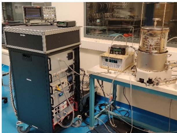
Figure 8: System installed at LNE and LNE-CNAM. The pressure balance (PG-7607 with automatic weight changing system) can be seen to the right of the TOP.

At LNE and LNE-CNAM, the system was unpacked and installed in the same time frame as at the previous sites, see Figure 8. This time, however, it was not operational straight away; it had obviously been unfavourably affected by the transportation. During installation, some “issues” became apparent which took approximately two full days to solve. These were related to untightened screws; optical fibres were not attached firmly to their connectors, the cavity ensemble was not firmly attached in its correct position, etc., which all were attributed to vibrations during transport.