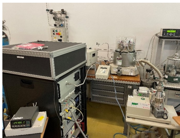
Figure 7: System installed at INRiM. The pressure balance can be seen on the table behind the TOP.

Figure 7 shows the system when installed and fully operational at INRiM. Here, the TOP was placed next to a “stable table”, on which the pressure balance was installed (seen to the right on the table, behind the TOP).