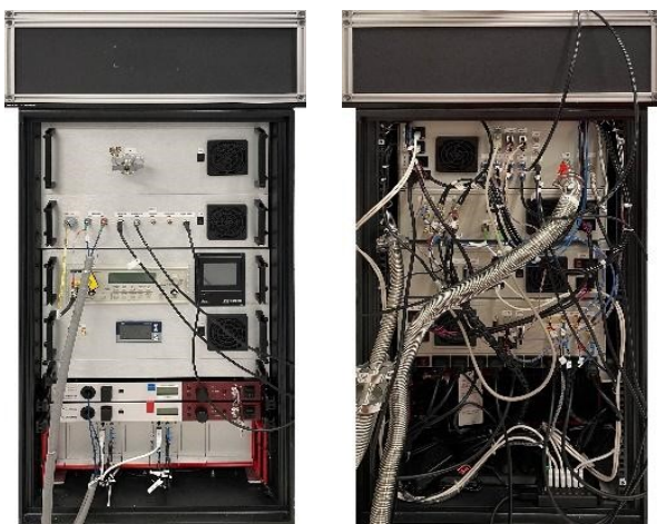
Figure 1: The TOP from a front (left) and rear (right) point of view.

The system differs from a previously constructed stationary system (SOP) [3], [5], [7] primarily by the way the temperature is assessed; instead of assessing the temperature with respect to a Ga fixed point cell, it utilizes calibrated Pt-100 sensors. This contributes to its uncertainty by 20 parts-per-million, which is on par with the uncertainties of pressure balances used in the circular comparison. Its short-term precision has been shown to be significantly better than its uncertainty, in the 1:10^8 range [4].