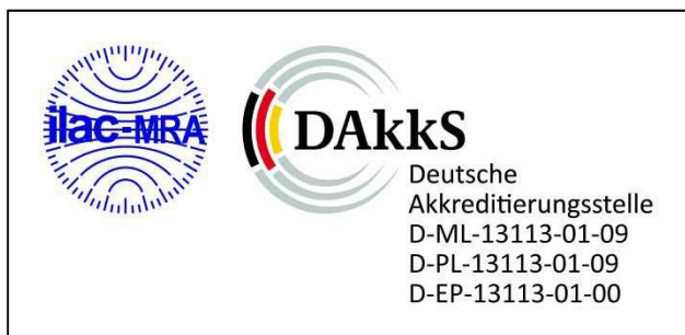
Fig. 2: exemplary combined DAkks/ILAC-logo with a registration number of a medical (ML) and test (PL) laboratory and proficiency testing provider (EP) of the RKI

All four sites of the RKI own and operate accredited laboratories, each one different and unique. Every laboratory holds its own remits, pathogens and testing methods. There are epidemiological laboratories besides consultant laboratories. Each laboratory is accredited independently and according to different norms. The following national reference centers (NRZ), consultant laboratories (KL) and other laboratories have been successively accredited since 2010.