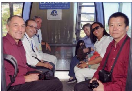
Way up to Monte...

The cultural visit took people to different locations around Funchal on Wednesday afternoon, including a trip to Monte, where a large majority of attendees braved a rather unsafe and dangerous toboggan ride down car infested roads, as you can see in the following pictures. We all came back safe and enjoyed the conference dinner that concluded the event on Thursday evening.