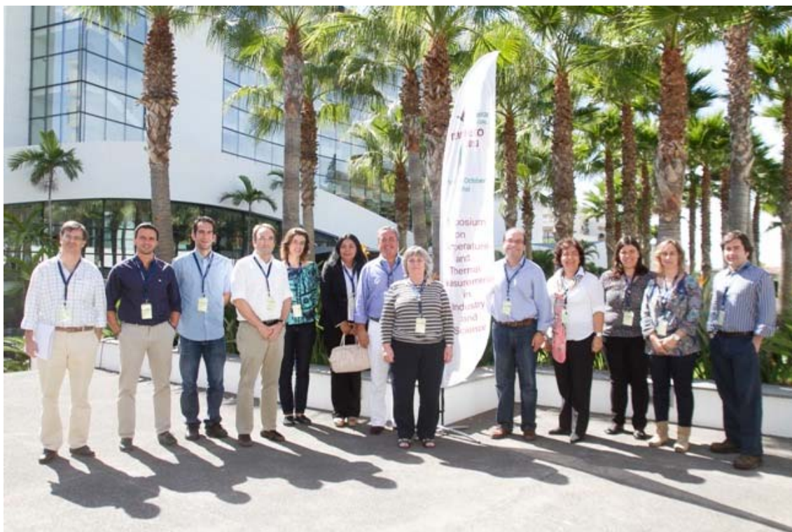
The Portuguese National Organizing Committee

We would like to conclude by thanking all the Portuguese Organizers for their excellent work and warm hospitality.