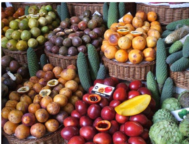
Market colours in Funchal

Beyond the technical and scientific aspects of the Symposium, the participants had the opportunity to enjoy Funchal and its surroundings, as well as the many cultural and recreational activities available in the Madeira Islands.