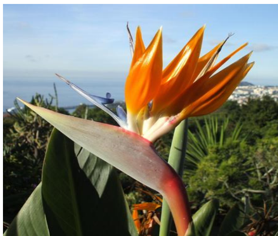
A real strelitzia, the symbol of TEMPMEKO 2013

The conference was attended by 291 scientific participants, with the addition of 28 accompanying persons. The scientific attendees came from 42 countries; their geographic distribution is presented in the following table.