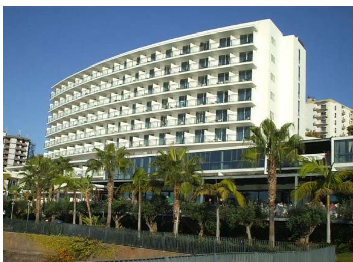
The conference hotel