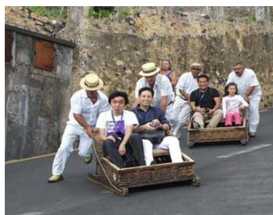
and way down!