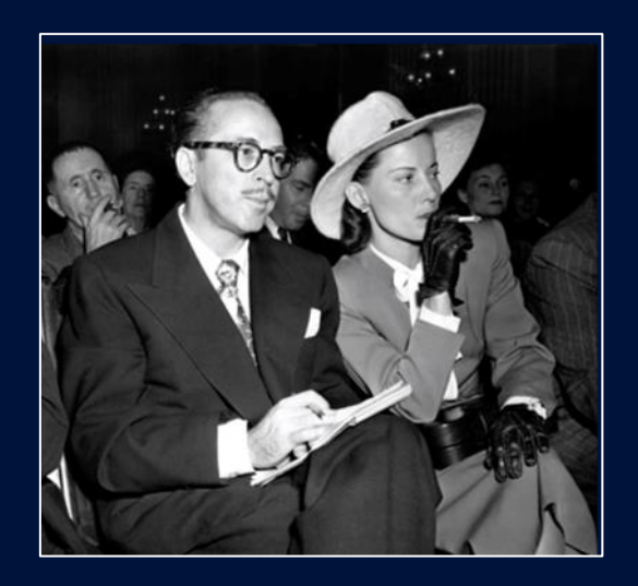
(Not IMEKO related picture)

The preparation for the recent 65<sup>th</sup> IMEKO anniversary led to some "early days" research and the sorting through of a large quantity of some remarkably well-preserved materials from the 1960s, all in the Secretariat's possession.